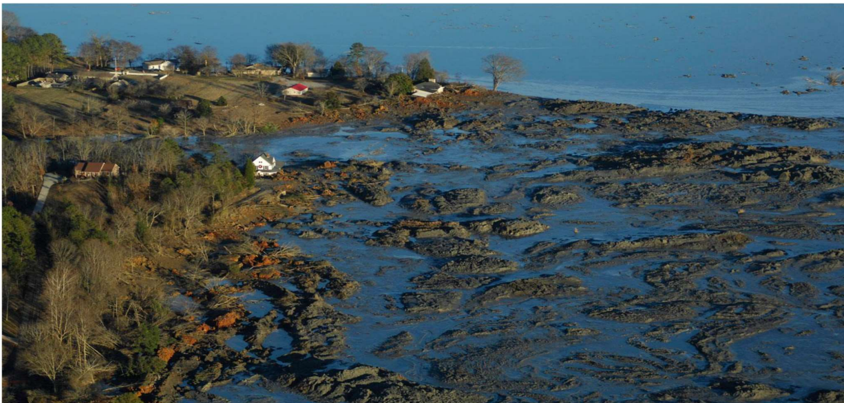
Coal ash spill, TN